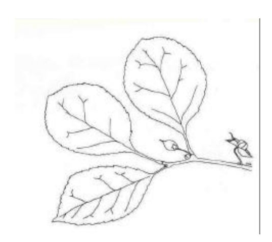
Oriental Bittersweet A woody perennial vine that grows over and around other plants. Leaves are alternating and the fruit can be poisonous to mammals.

Invasive and nuisance plants are plants that take over a habitat and/or affect the use of an area. What better way to spend a spring day than by removing nuisance plants from conservation land! Here to help you with your task is a handy guide to unwanted plants.