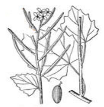
Garlic Mustard A biennial herb that prefers moist shady soil. Each plant produces hundreds of seed, dispersed on the fur of passing animals. This plant is displacing native woodland flowers.